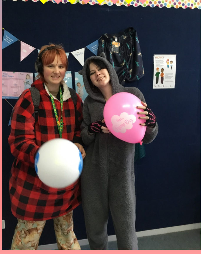
NEFLN Values - Respect | Resilience | Reliability | Resourcefulness