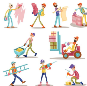
C.I. Card Construction Induction