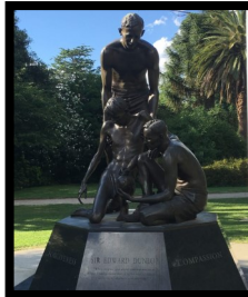
Sir Edward 'Weary' Dunlop Benalla Memorial Committee

If you can make the time to volunteer, please let your teacher know.